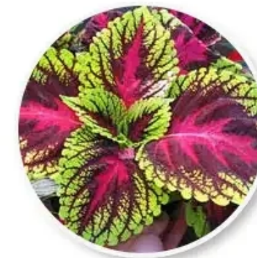
Coleus Fat Burning Aid