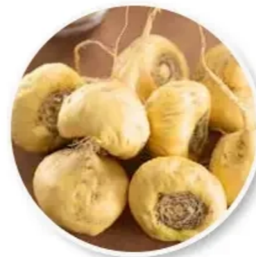
Maca Root Boosts Your Energy