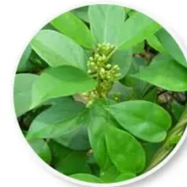
Gymnema Supports healthy heart & blood sugar