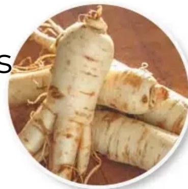
Ginseng Supports Healthy Blood Glucose