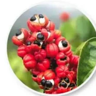
Guarana Stimulates Your Metabolism