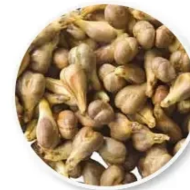
Grape Seeds Supports Your Heart