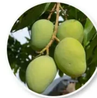
African Mango Fat Burning Agent