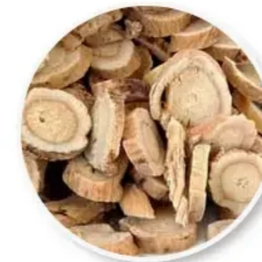
Astragalus Heart Health & Longevity Agent