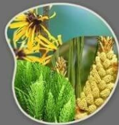
Witch Hazel, Scots Pine and Horsetail Extract