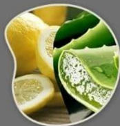
Lemon Peel Extract & Aloe Vera